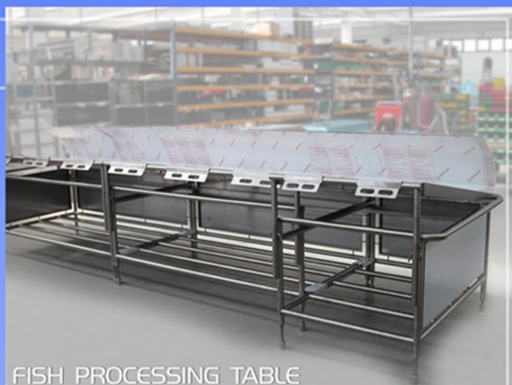
FISH PROCESSING TABLE