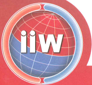
Geom. Emilio Miniussi

The standards and documents referred in the certificate and schedule are those valid at the time of certification