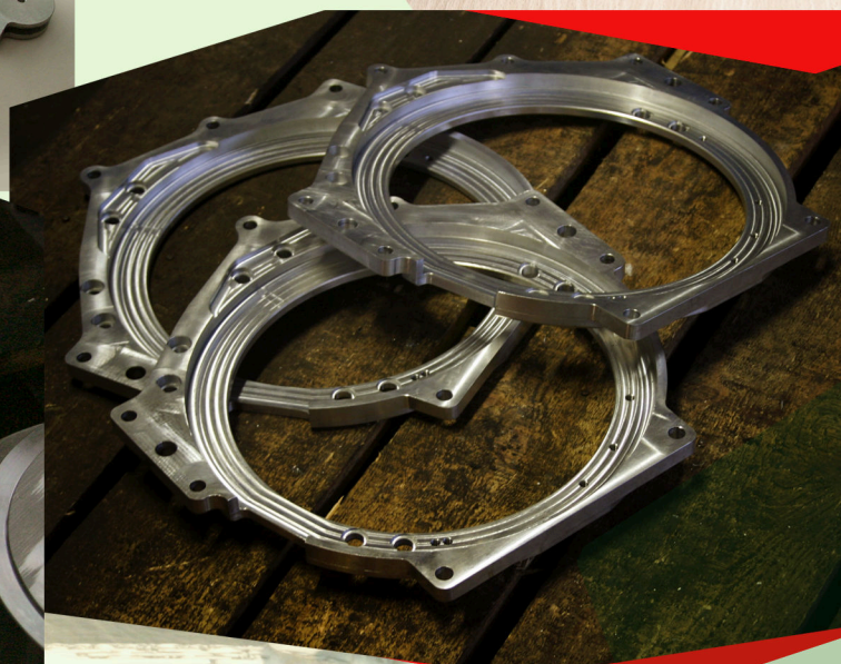
VERTICAL MACHINING CENTRE HARTFORD VMC-2060AG. 4-axis milling machine.