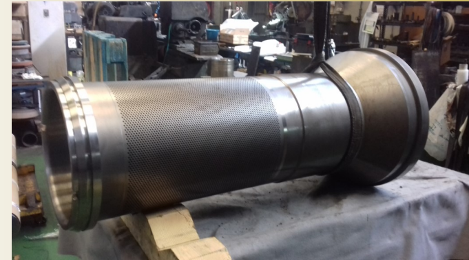
4.- STAINLESS STEEL Ni-Coated GRINDING