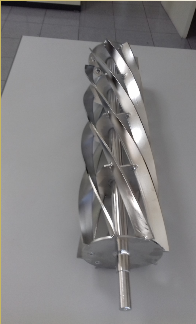
1.-STAINLESS STEEL electro polished and dynamic balanced