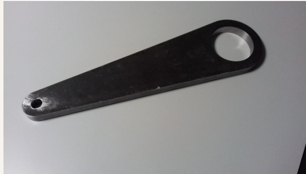
2.- St-52 LASER