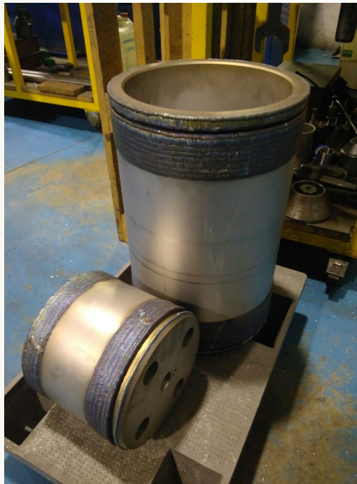
3.- STAINLESS STEEL STELLITE WELDING