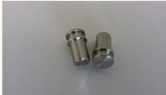
4.- STAINLESS STEEL